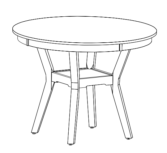
MADE IN VIETNAM